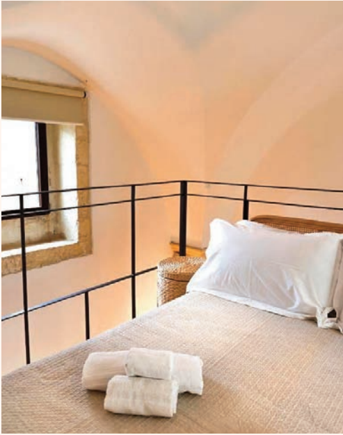
Detail sleeping area