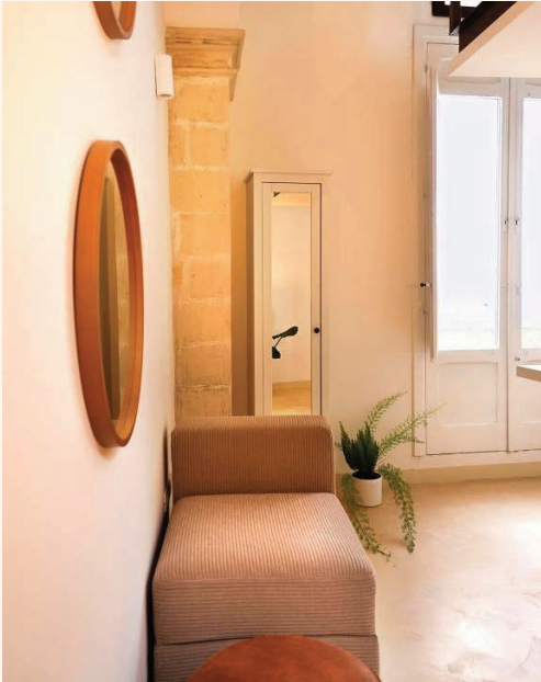
Living room detail