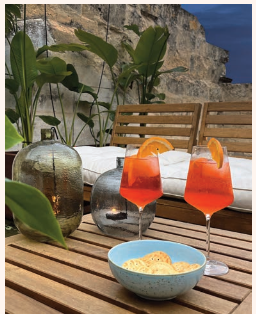
Terrace in the evening