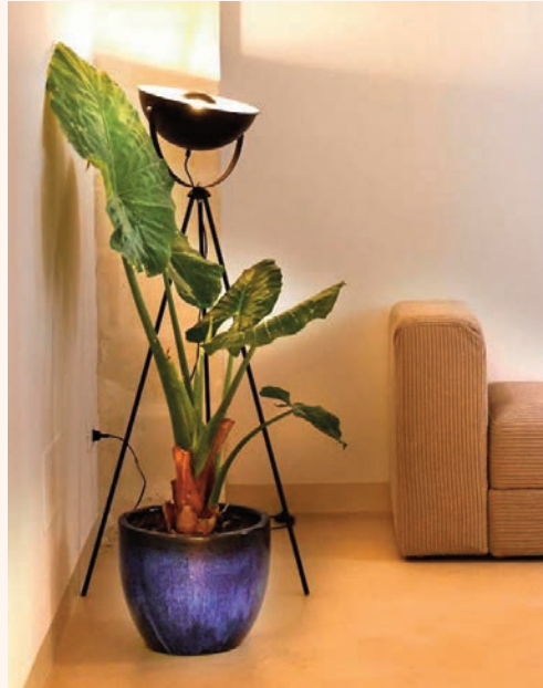
Living room detail