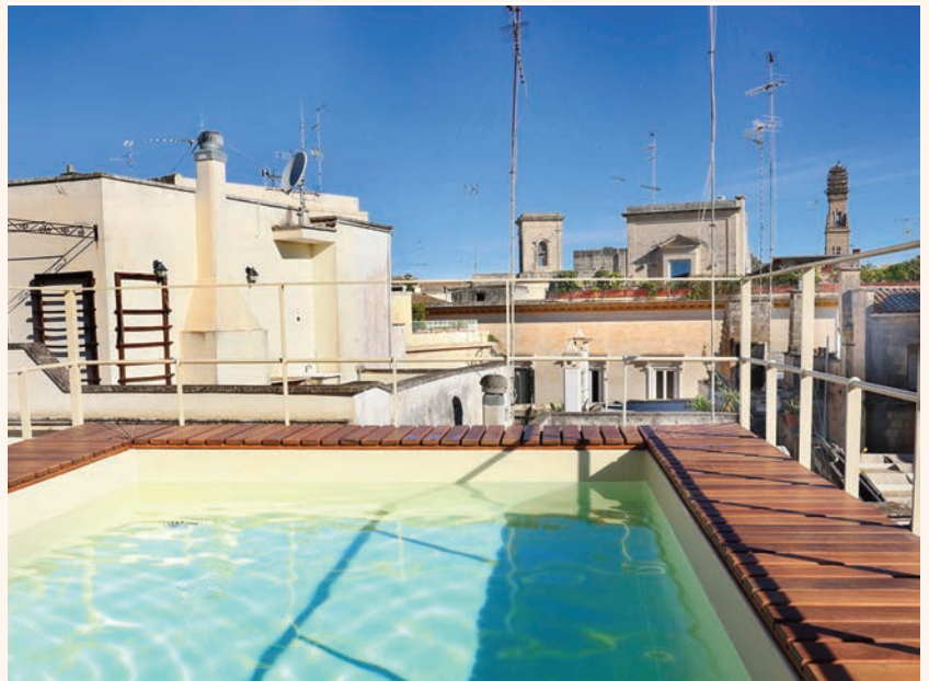
Pool on terrace