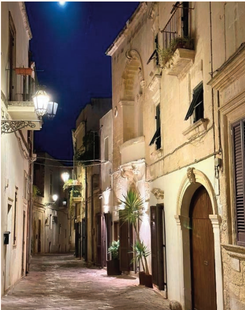
The Vico dei Petti at night. Villa Acqua has the house number 3.