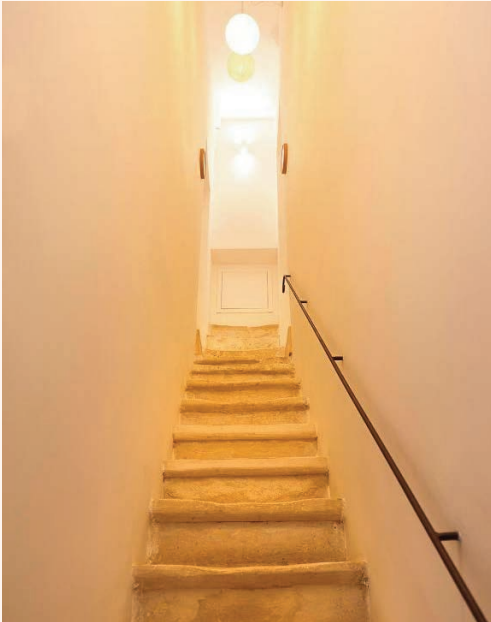
Stairs to the apartment