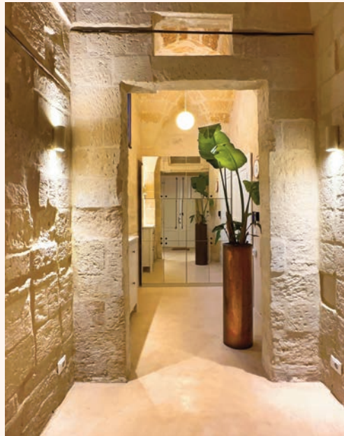
Common entrance area