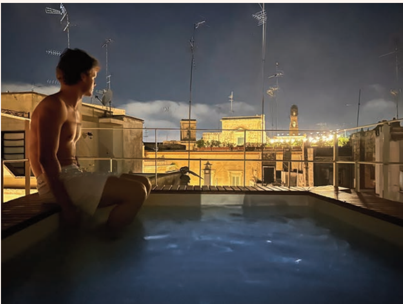
Pool in the evening